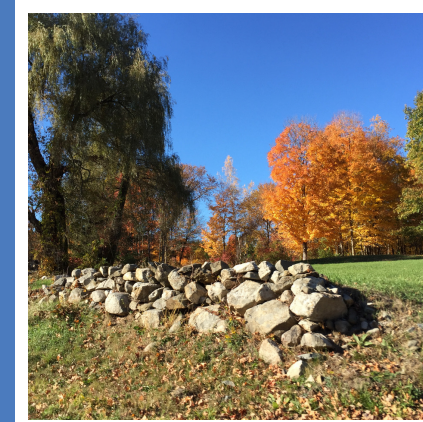
Autumn's Arrival

The route is located wholly within Rockingham County, and consists of two contiguous segments with distinct interpretive themes. The Old Stagecoach Byway begins in Atkinson at the state border and travels northwest along NH Route 121 through Hampstead, Chester, and Auburn to Massabesic Lake. The adjoining Robert Frost Byway follows NH Route 28 and local routes south through Derry village to the Robert Frost Farm State Park, and continues along local roads eastward until it reconnects with NH 121 and the Old Stagecoach Byway in Hampstead.