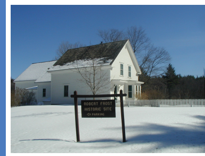
Robert Frost Farm