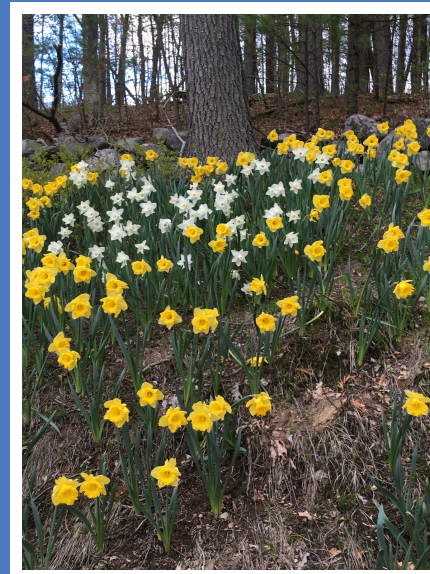
Byway Daffodils