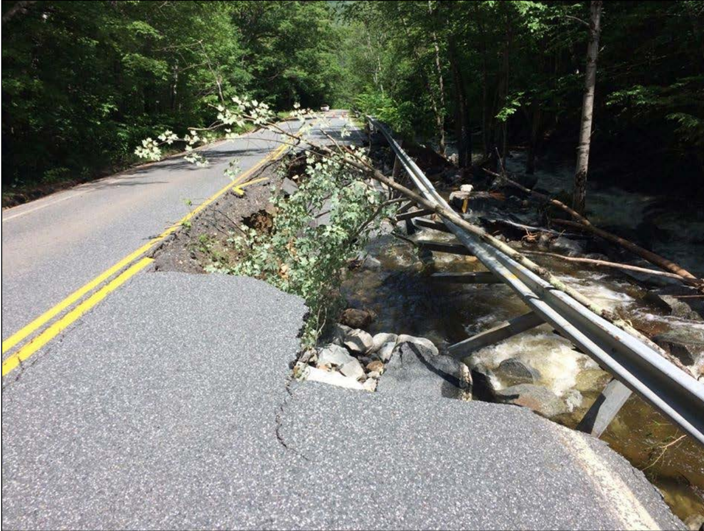
NH 25A Orford, NH; 2017