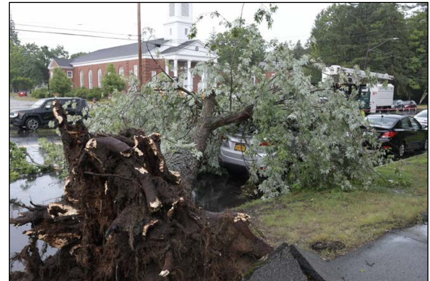
Downed tree in Manchester, NH after severe wind and rainstorm 2018