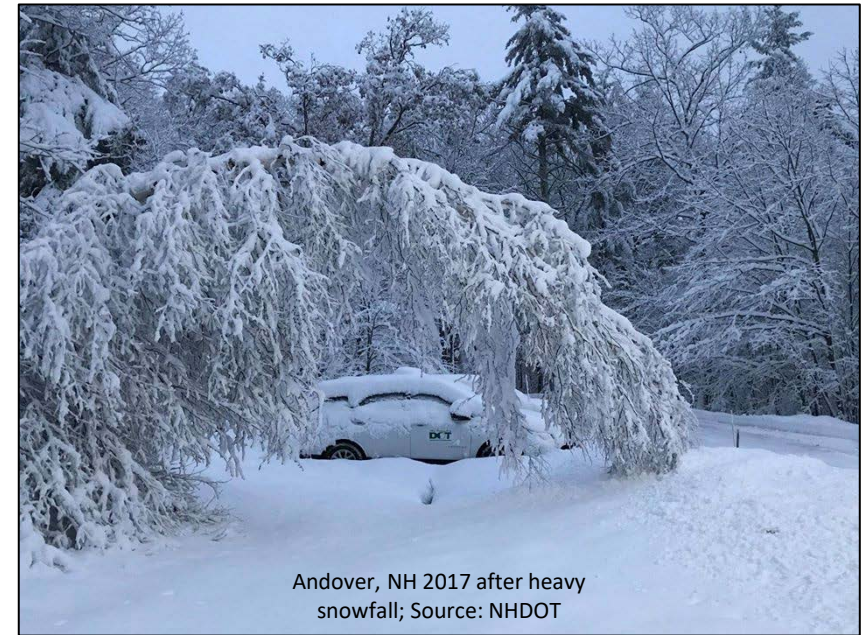
Andover, NH 2017 after heavy snowfall; Source: NHDOT