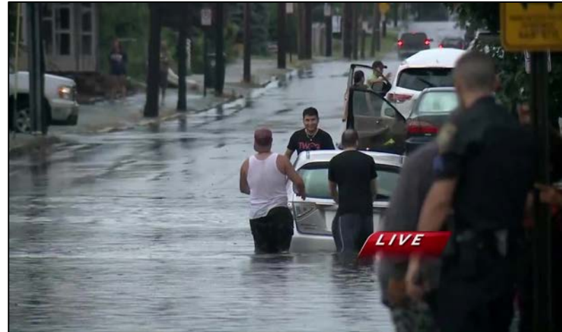
Flash flood Manchester NH, 2018; source: WMUR