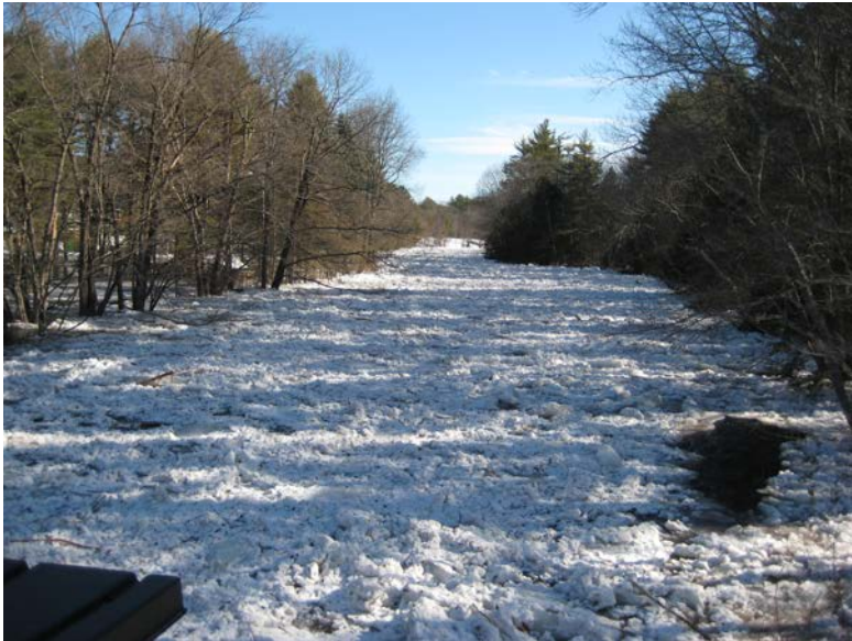
New Boston, NH