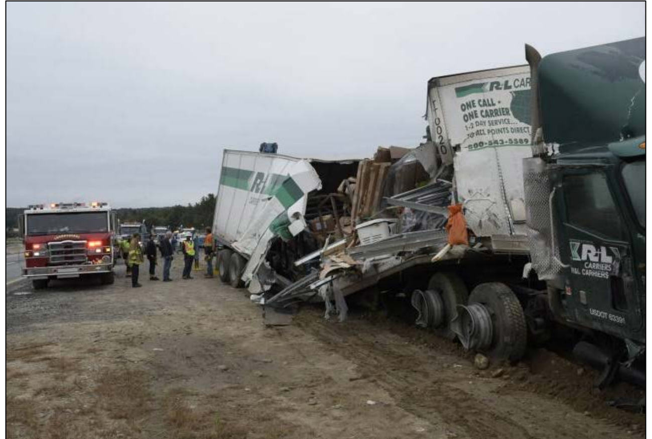
Tractor-trailer truck on I-93 north in Londonderry on Sept. 27, 2018.