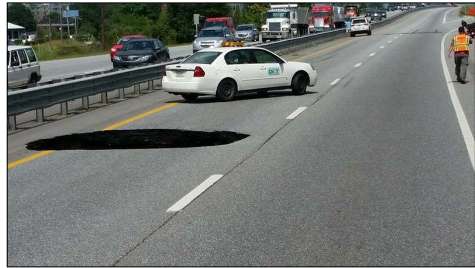
Sinkhole on Interstate 93 North between Exits 13 and 14 in 2015 due to failed culvert dating back to 1950s and significant rain the night before.