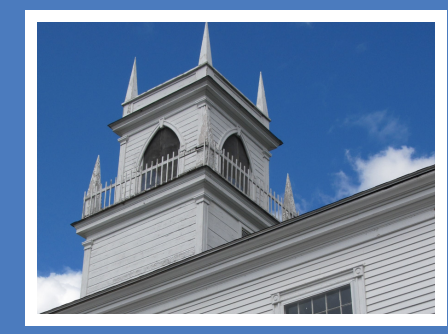
Old Town Hall, Weare