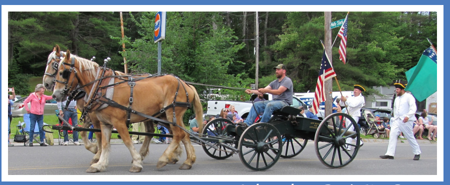
Independence Day in New Boston

Aside from its rich history, the byway captures the beauty and charm of quintessential small-town NH. Picturesque villages, open farmlands, and rolling hills can be viewed along the route. Nearby conservation areas protect the natural features, open space, and forest lands of the region. For the many historical, cultural and scenic features along its route, the GJSSB offers the visitor an "off-the-beaten path" experience through a distinctive, little known part of New England.