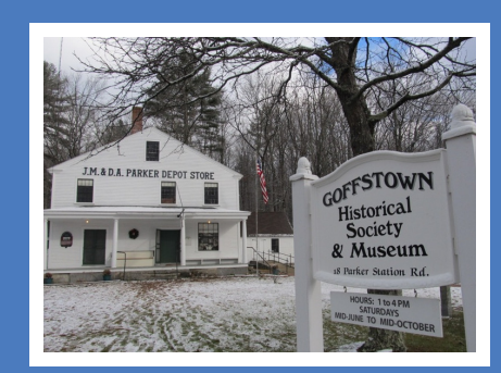
Parker Depot Store